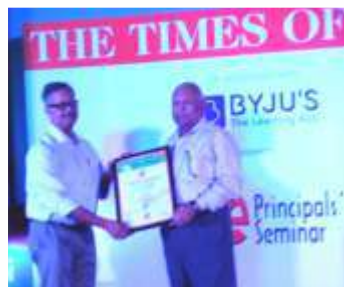
Best Educationist Award in NIE Principal's Seminar on 26th Oct., 2018 for excellence in education organised by The Times of India.