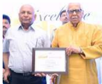
The prestigious "Excellence in Education" award by Honorable Governor (U.P.) Shri Ram Naik Ji on 27th June 2015