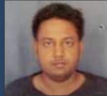
Saddam Husain HCL