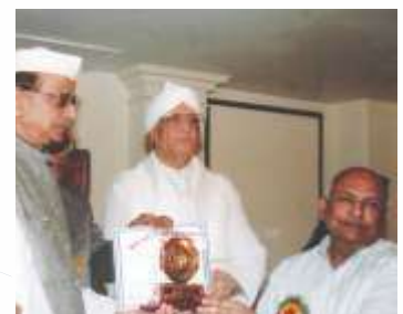
The Best Educationist Award by Hon'ble Former Governor Vishnukant Shastri (Govt. of U.P.) in 2002