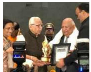
The Best Educationist Award in U.P. by Hon'ble Governor of U.P. Shri Ram Naik, in Marvellous Legend Summit - 2017