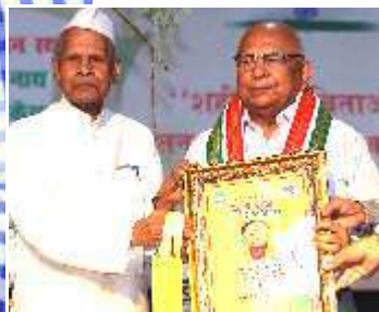
Awarded UP Ratna Award by Hon'ble Ex Governor Shri Mata Prasad ji on 25th July, 2019