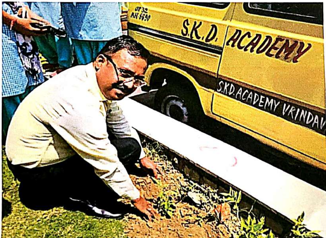
Principal SRI KRISHNA DUTT ACADEMY 2D/HS-1, Vrindavan Yojna Raibareilly Road, Lucknow